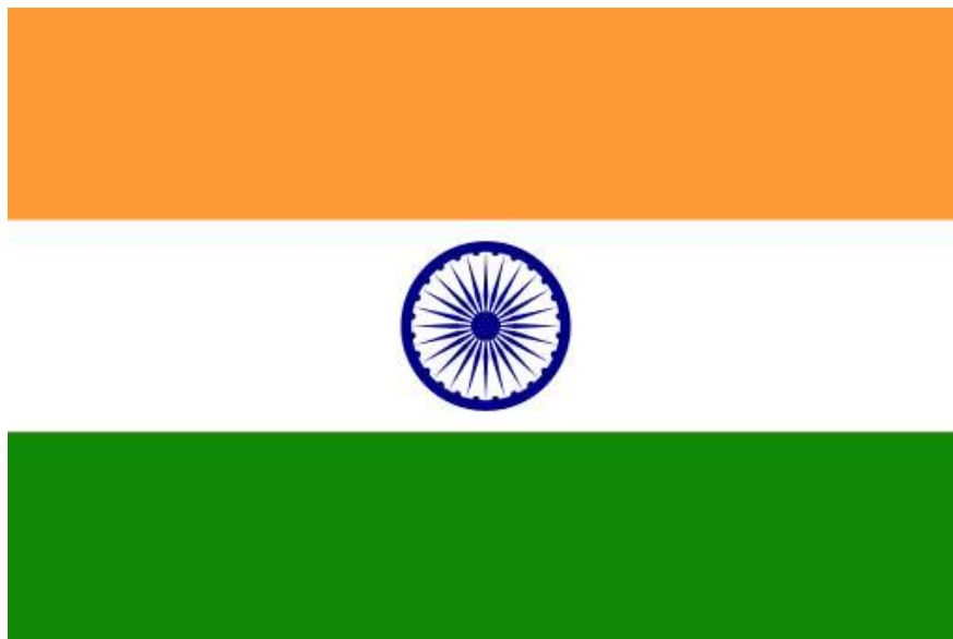
The Flag of India

The flag of India proved to be our inspiration for the design of the face of the sundial. In particular, the Dharma Chakra wheel, found in the middle of the flag, is the wheel of law in the Sarnath Lion Capital. The Chakra is a Buddhist symbol dating back to the 200th century BC; it has 24 spokes representing life in movement, death in stagnation, and the 24-hour solar cycle. Our final design incorporated these spokes modified to align with the hour lines of the sundial, and this pattern of spokes was mirrored on the sides of the stainless steel gnomon. The spoked pattern was cut out of the gnomon giving it a lattice-like appearance that casts dramatic shadows.