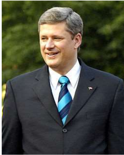
Prime Minister Stephen Harper