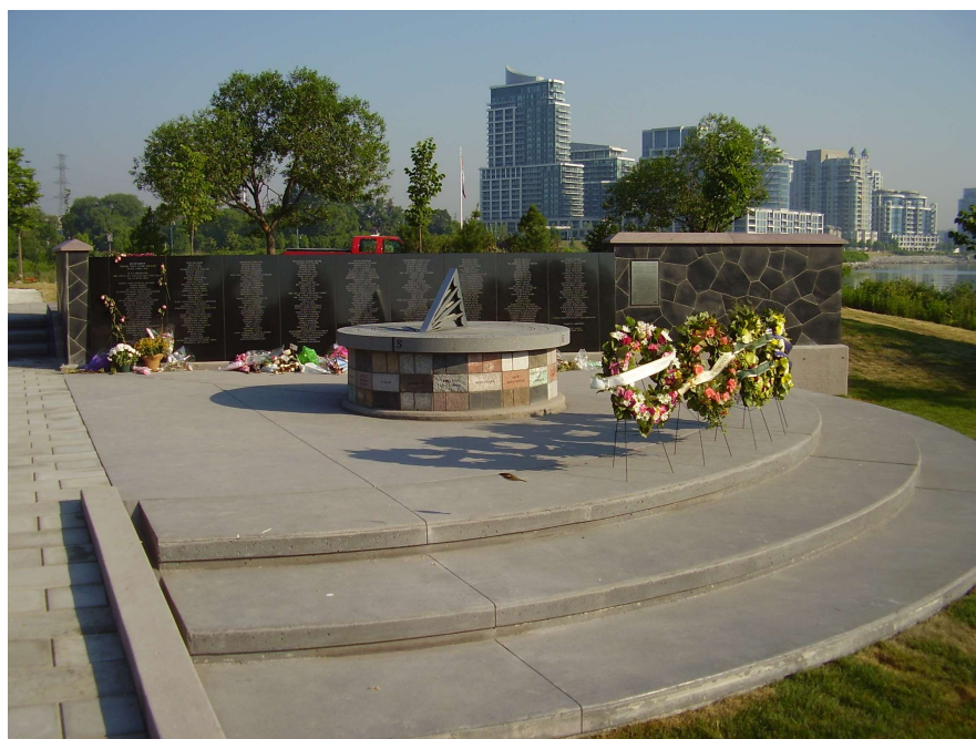
Project File Photo

R. Bouwmeester & Associates was commissioned by the City of Toronto in late 2006 to design the sundial feature for the Air India Flight 182 Memorial planned for the Toronto, Ontario, waterfront. The Memorial was built in early 2007 in Humber Bay Park East which is located at the foot of Park Lawn Road south of Lakeshore Boulevard West.